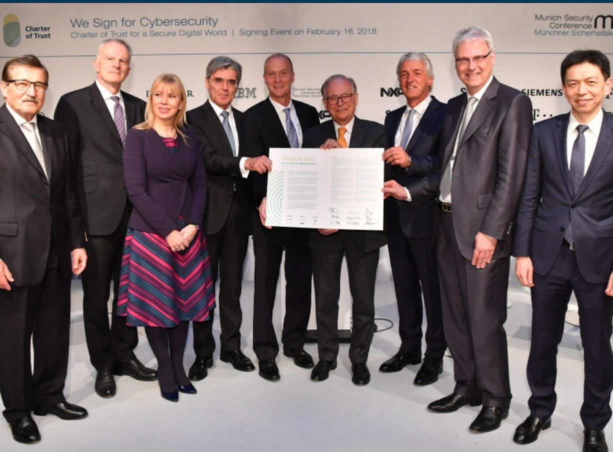
Where it all started: Munich Security Conference 2018